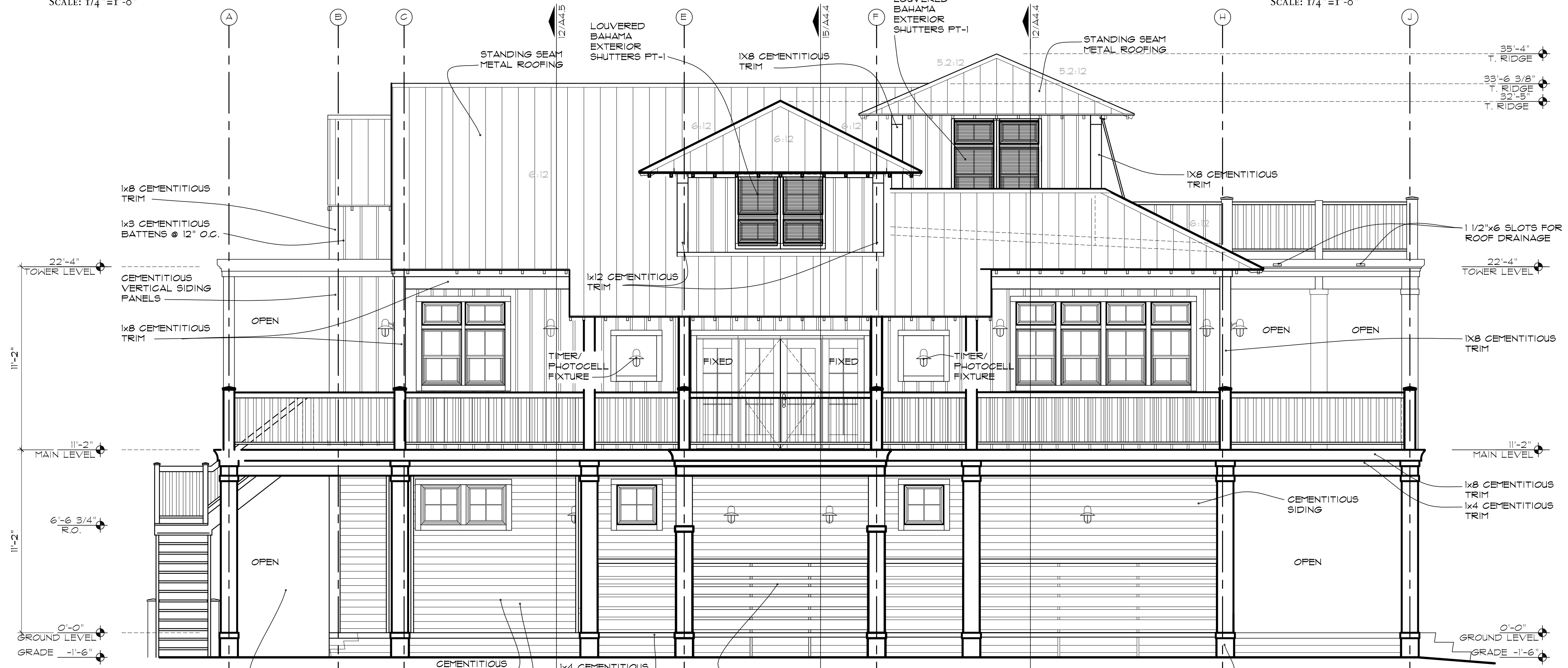
12 - SOUTH ELEVATION